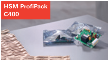
HSM ProfiPack C400