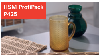
HSM ProfiPack P425

For small and light products, padding mats from the HSM ProfiPack C400 are perfect.